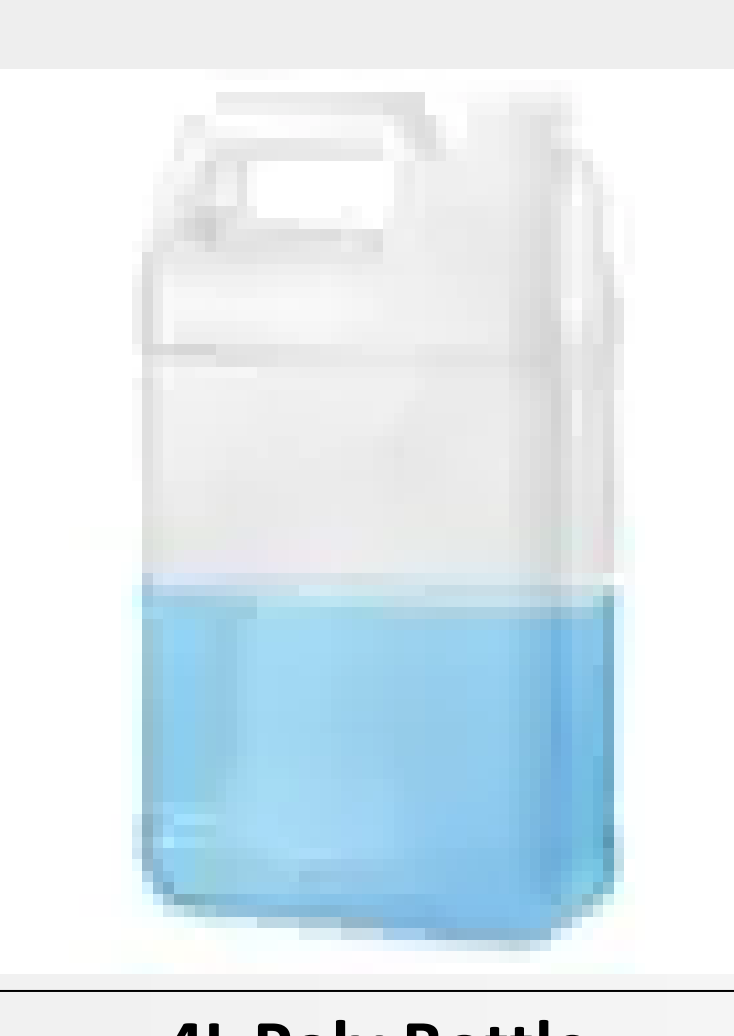
4L Poly Bottle with Flat Lid Price - $7.14 each