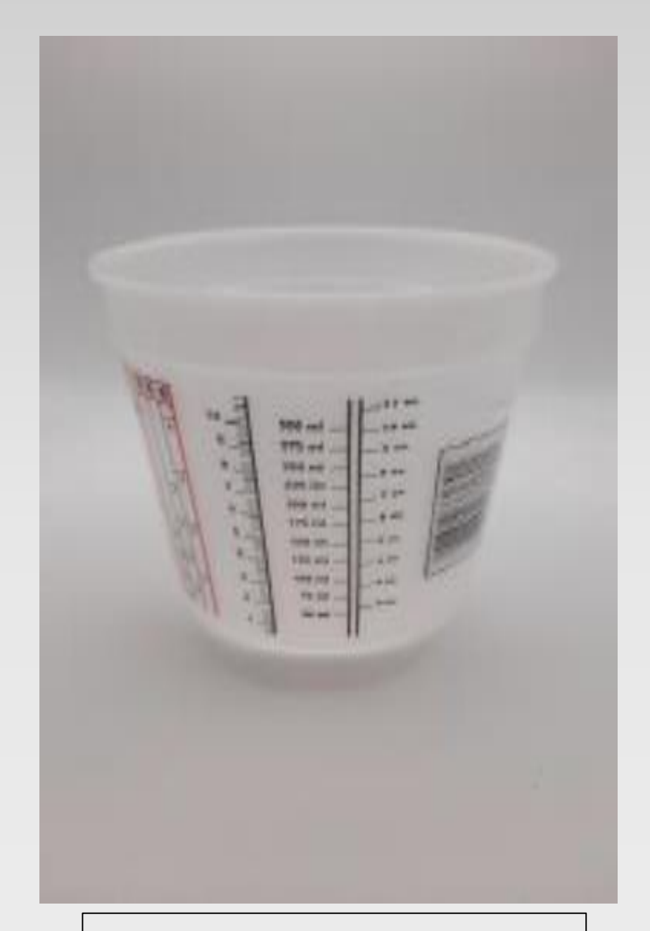
1 Pint Mixing Cup No Lid Available Price = $0.90 each