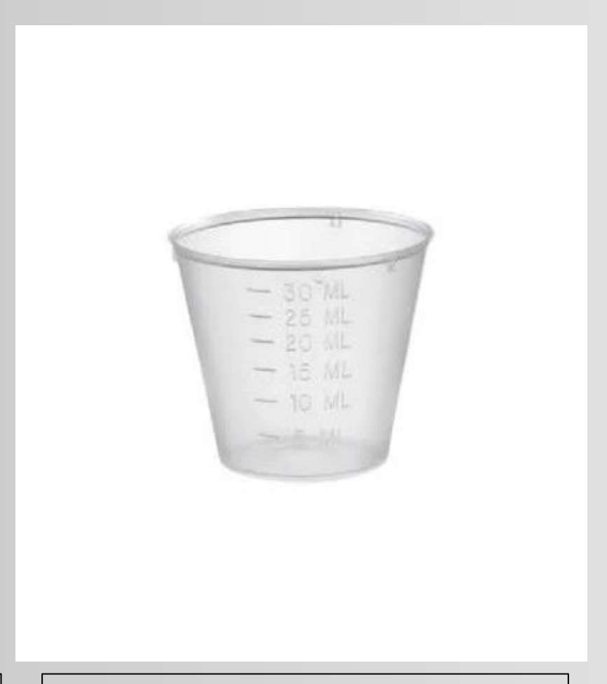
30ml Mixing cup Pack of 100 Price - $10.00 each