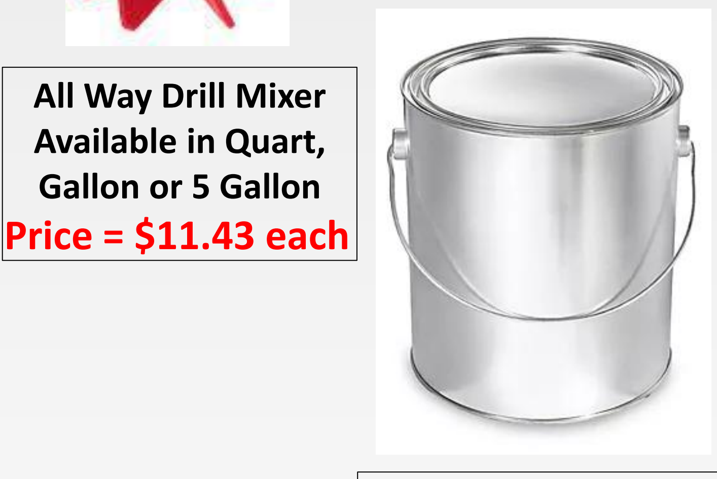
Metal Gallon Can Price - $8.04 each