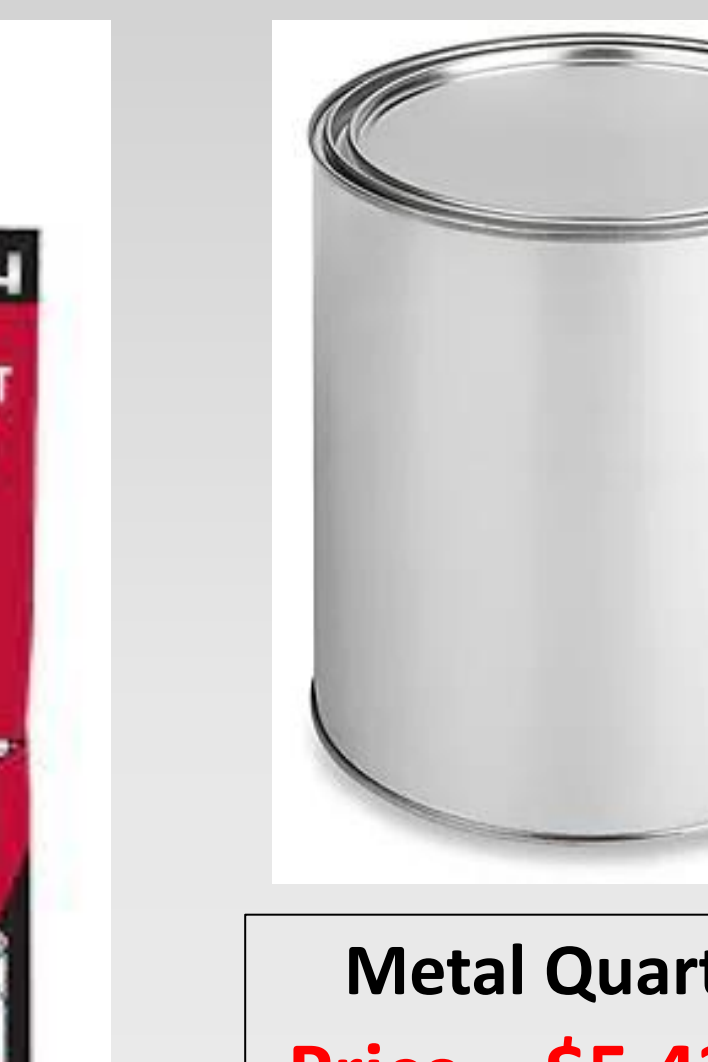
Metal Quart Can Price = $5.43 each