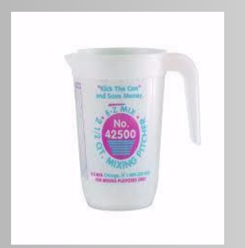
EZ Mixing Jugs Available in 2.5 QT & 4 QT Price - $10.09 – 13.84 each