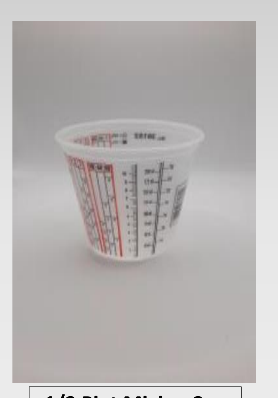
1/2 Pint Mixing Cup Lid Available Price = $0.84 each