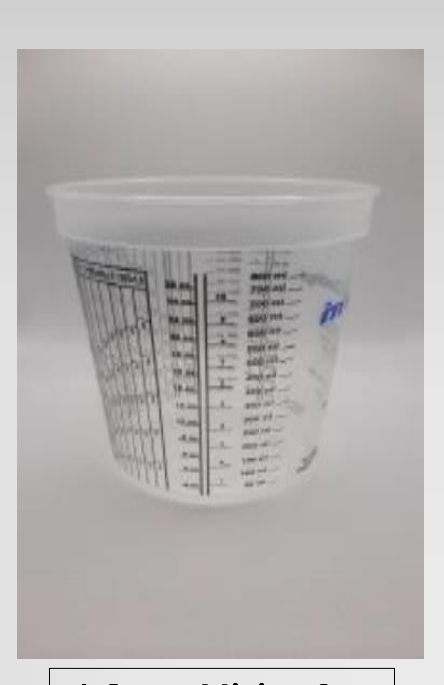
1 Quart Mixing Cup Lid Available Price = $1.25 each