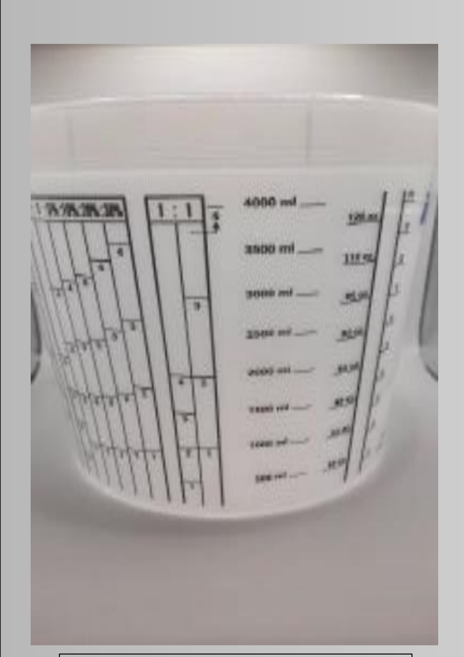
5 Quart Mixing Cup Lid Available Price = $3.40 each