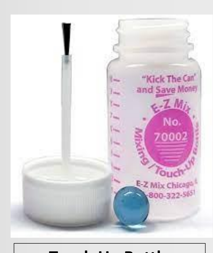
Touch Up Bottle