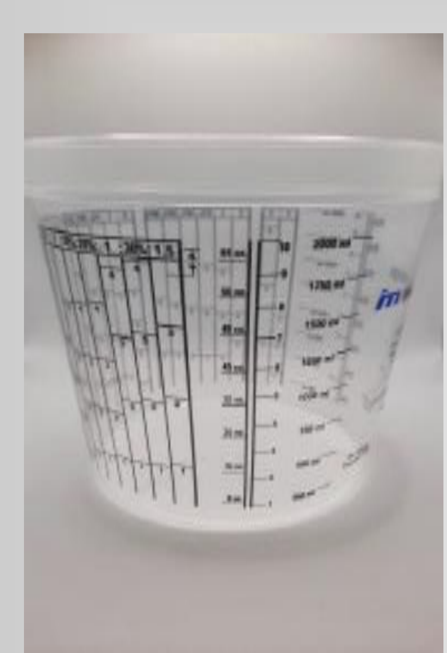
2.5 Quart Mixing Cup Lid Available Price = $1.97 each